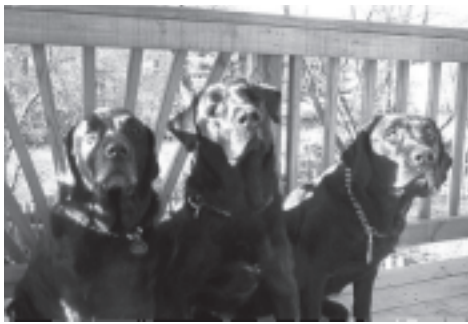
Stoney, Lefty and Chloe